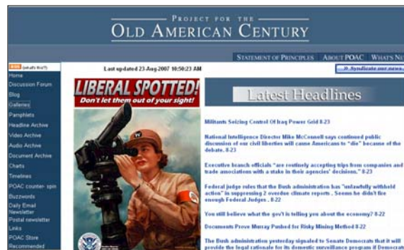
Screen capture of our website